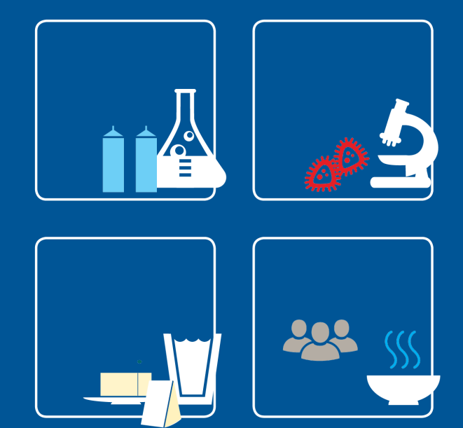
IMAGE: Forbedring af kvalitet og stabilitet af UHT behandlede mejeriprodukter ved enzymatisk design af mælke-sukkerprofil

IMAGE: Improvement of the quality and stability of UHT treated dairy products by enzymatic tailoring of the milk carbohydrate profile